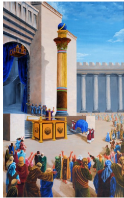
Most Excel. Master