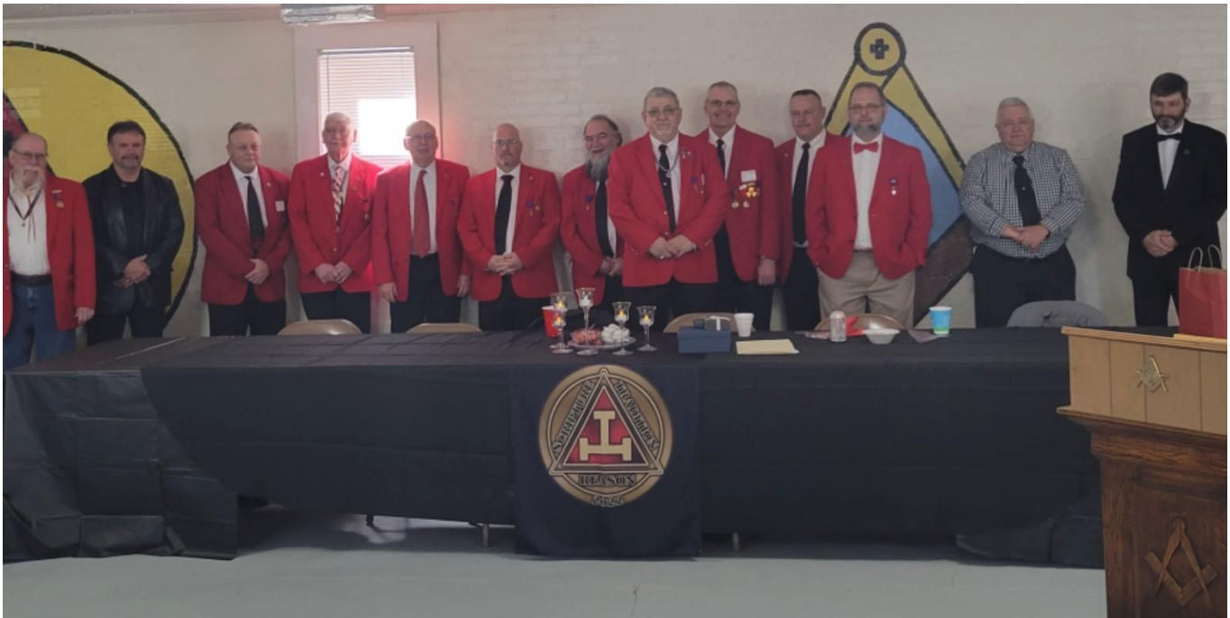
The MEGHP / MIGM's Official Visit to the 11 th Capitular District on 19 February.

May 28, District 4, Chapters 7, 3-9, 89; Dinner, 6:30 p.m.; Altavista