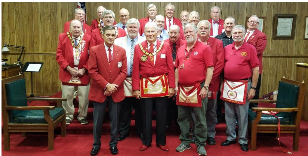
The Grand High Priest attended North Carolina Night at Mt. Nebo No. 20 on July 8