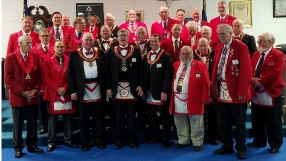
The Grand High Priest and Companions at the District 3 Visit on June 1