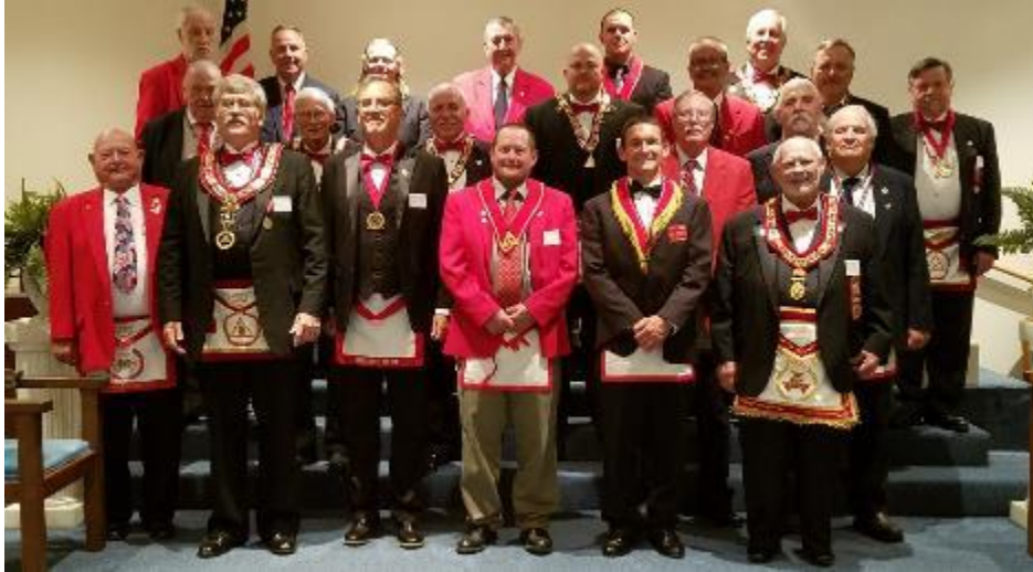
The Grand High Priest and Companions at the District 20 Visit on June 15