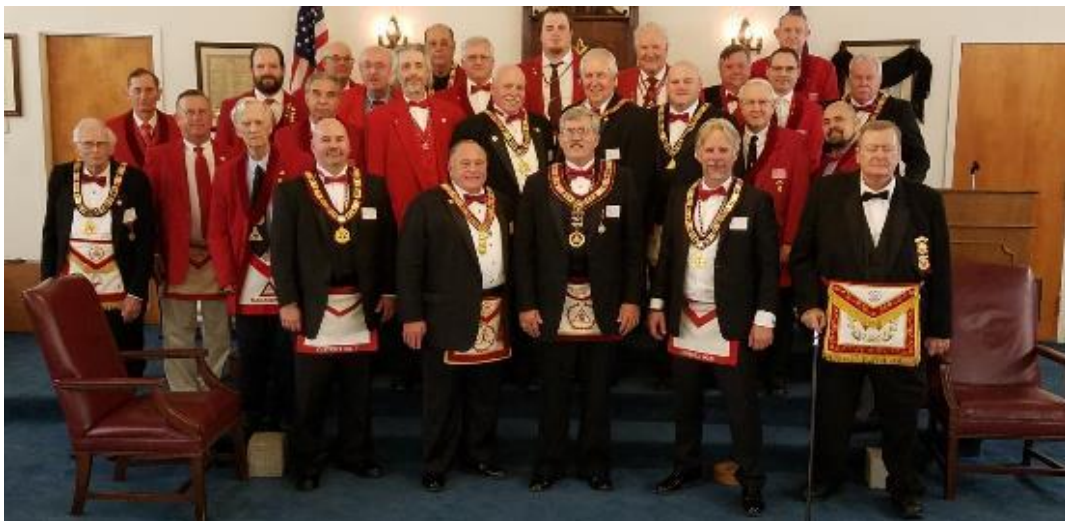
The Grand High Priest and Companions at the District 17 Visit on June 8