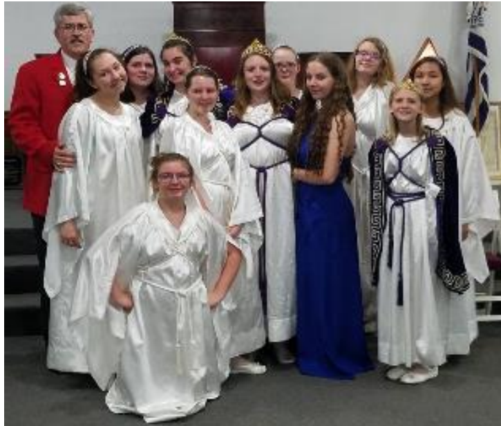
The Grand High Priest visited the Cradock Job's Daughters