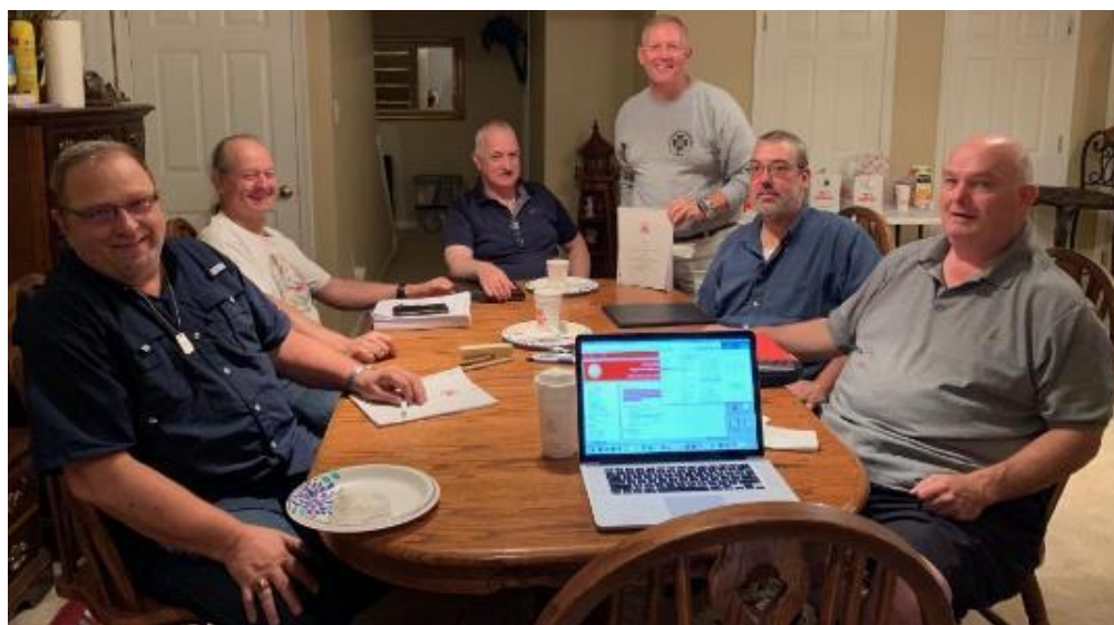
Fredericksburg No. 23 Companions Working on the Course