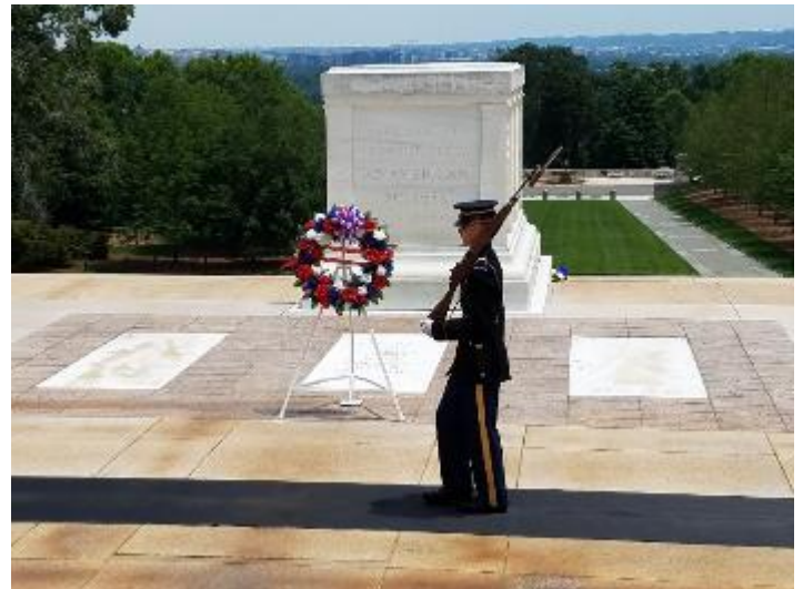
The Grand High Priest, Grand Officers, and family presented a wreath on June 16