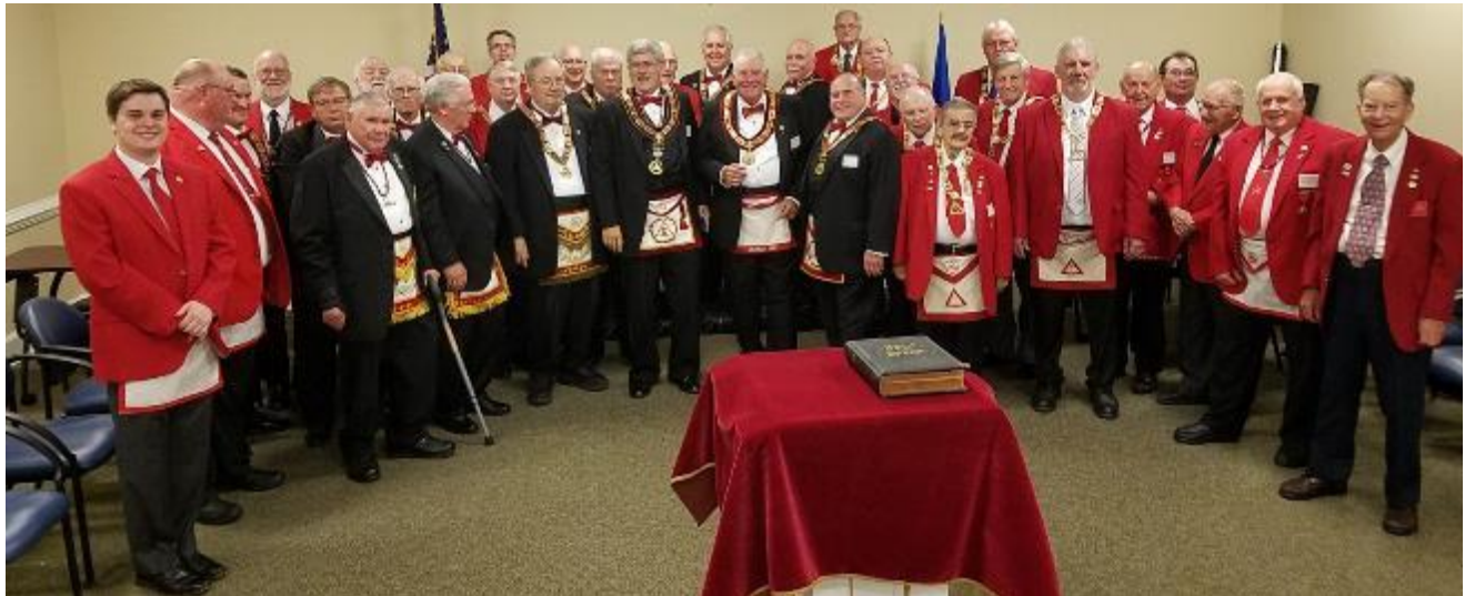
The Grand High Priest and Companions at the District 4 Visit on June 7