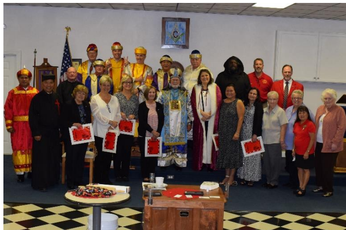
District 2 Royal Arch Widows Attendees