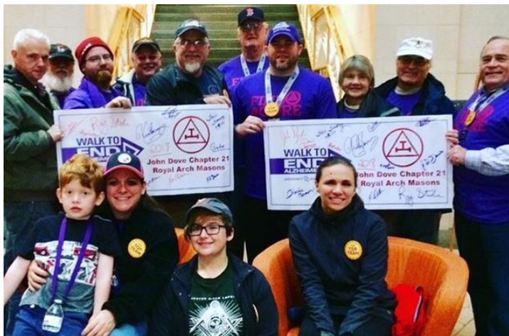
District 15 Walk Participants