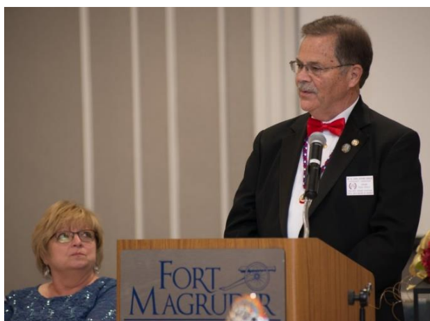
Mt. Ex. Surface at the GHP Banquet