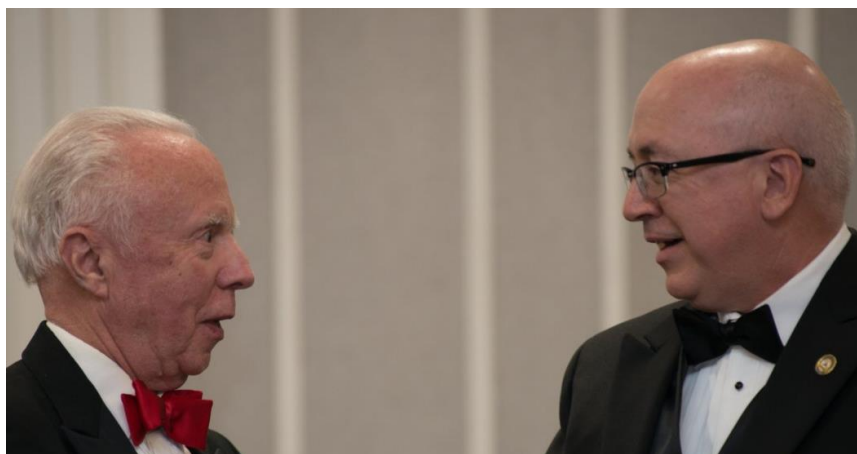
John Dove Meritorious Award Recipients