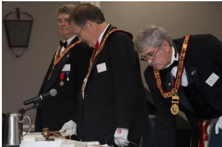
Mt. Ex. Surface Raps the Opening Gavel

Grand Chapter link to other Alzheimer's Walks: http://www.virginiaroyalarch.org/walk/