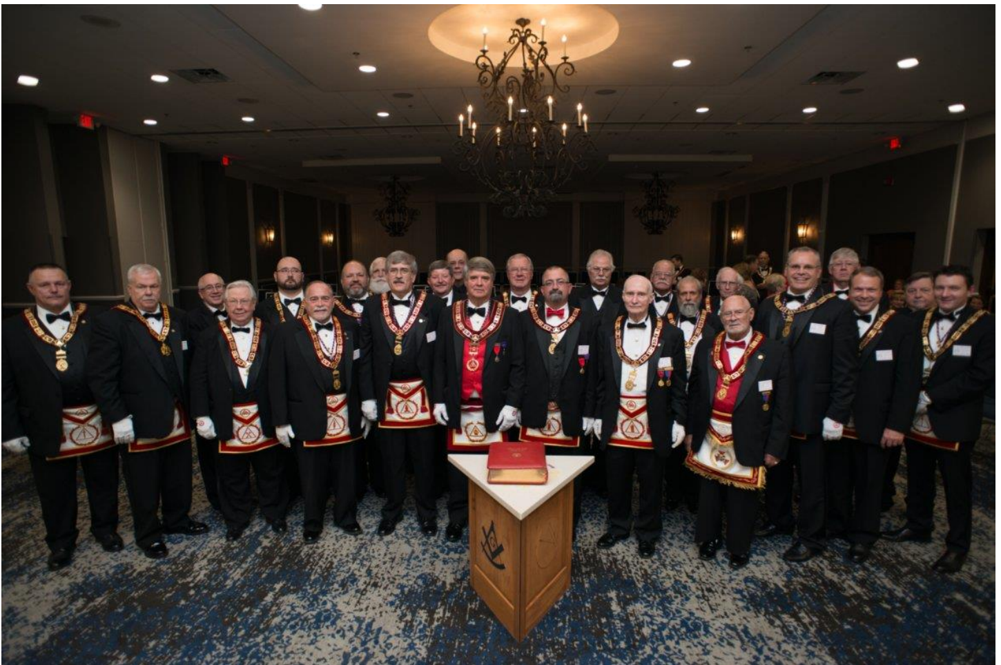
2018 Grand Chapter Officers