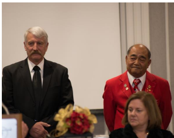
Ish Sodi Award Recipients