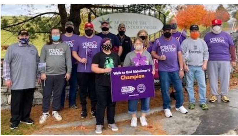
Companions receive Burcham Medal