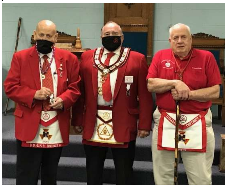
Visiting Fredericksburg No. 23