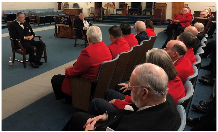
Grand High Priest Town Hall at Districts 1 and 17