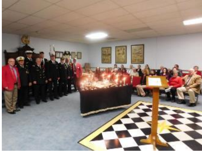
Allegheny No. 24 Christmas Program