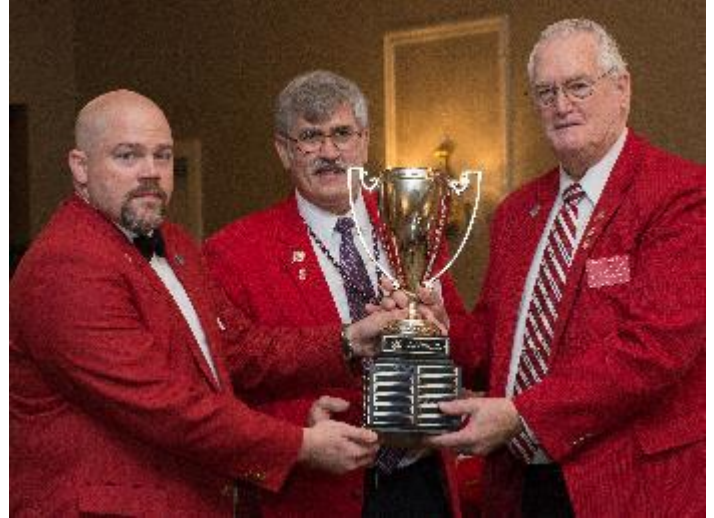
District 15 wins Grand Almoner's Trophy