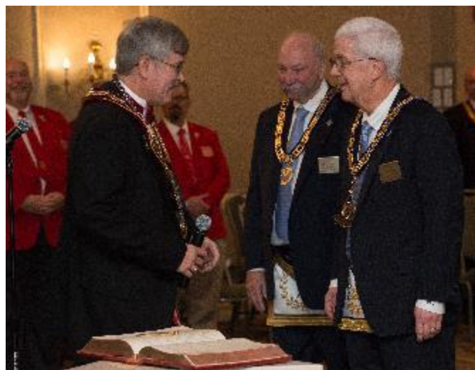
Grand High Priest enters Grand Convocation GHP Goodwin welcomes the Grand Master