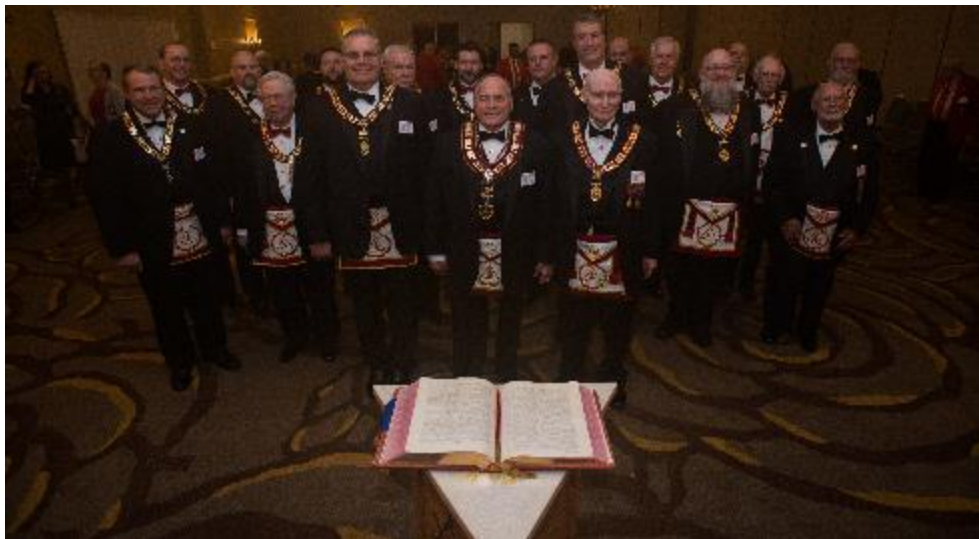
The 2019-2020 Grand Royal Arch Chapter Officers