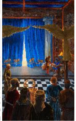
R. Master Painting