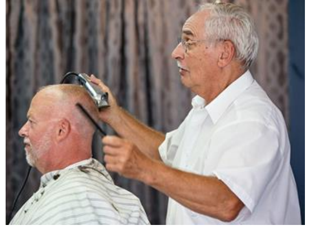
Companion Hamrick with customer