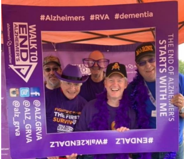
Fredericksburg Walk on October 12