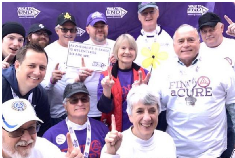
Winchester Walk on October 26