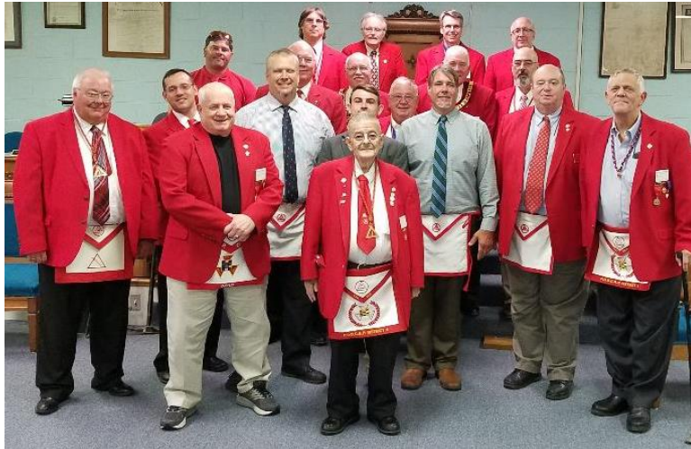
Three candidates exalted at Petersburg Union No. 7