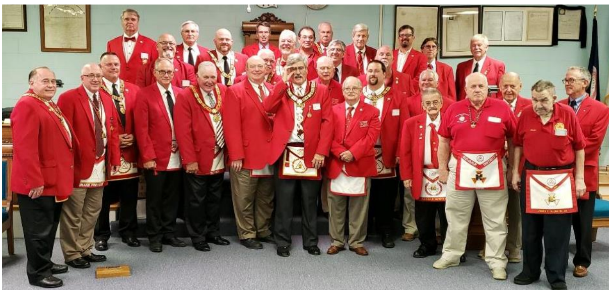
The Grand High Priest, Grand King, and Companions at Petersburg Union No. 7