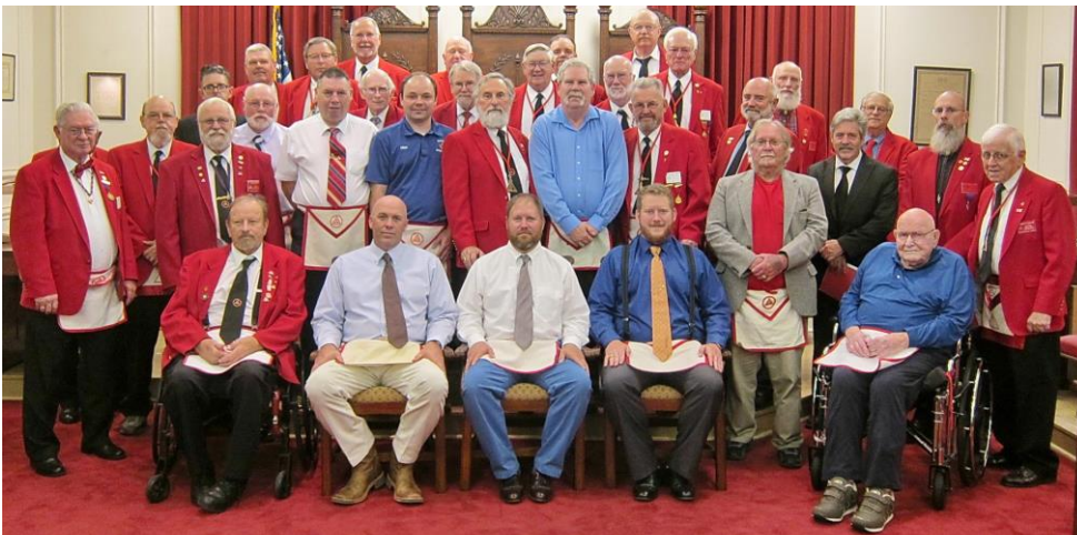
Eight candidates exalted at Keystone No. 58