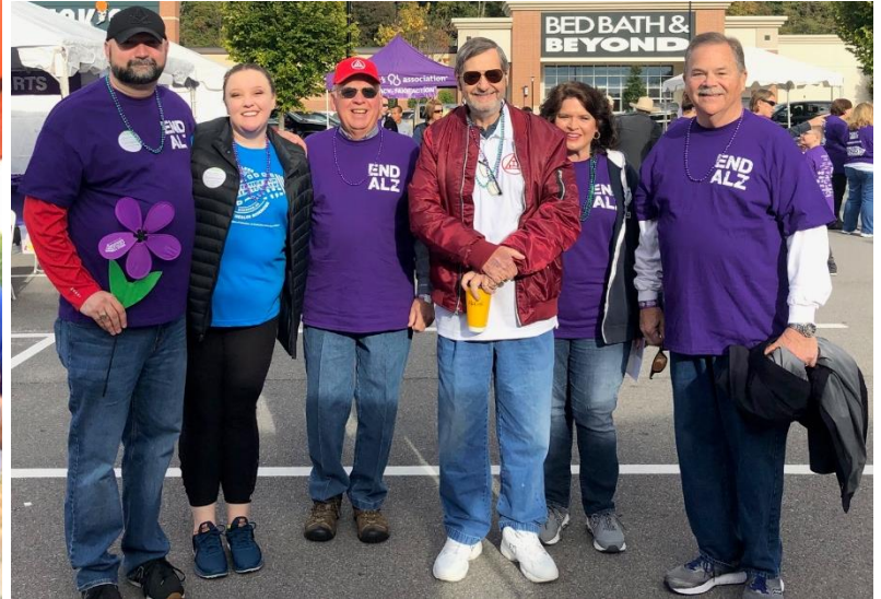
District 10 at Bristol Walk on October 19