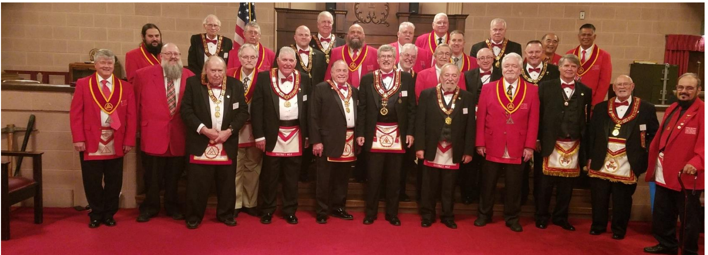
The Grand High Priest and Companions at the District 2 Visit on May 17