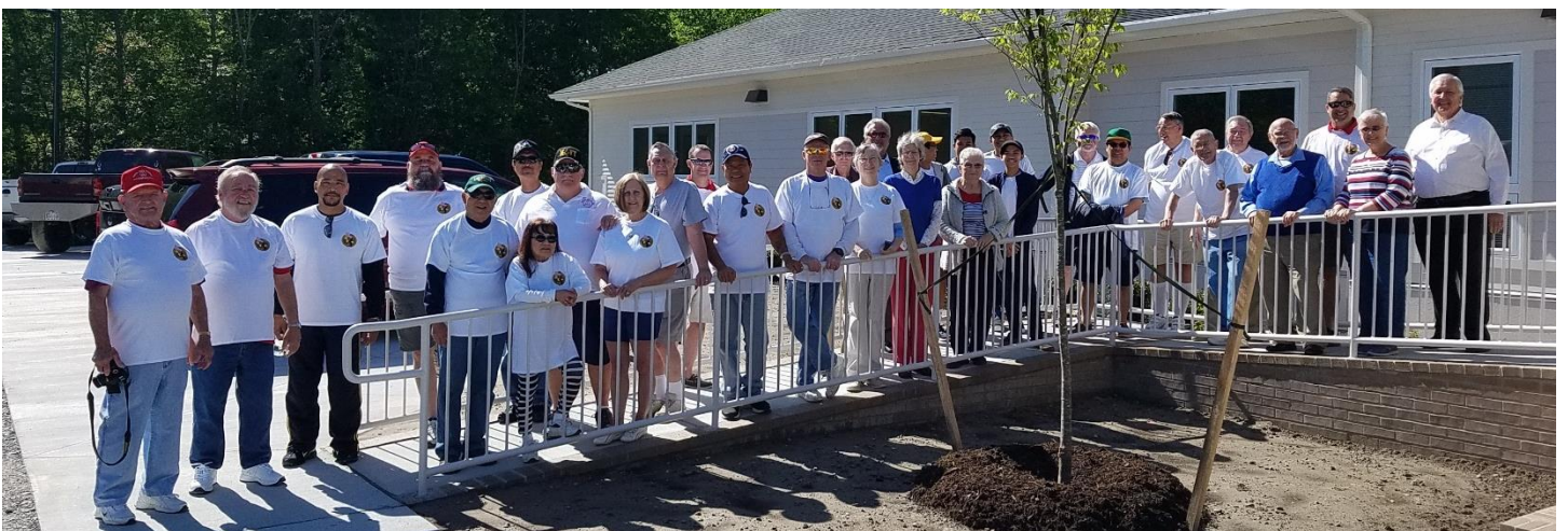
Districts 2, 3, and 21 Companions attend the Virginia Beach Alzheimers Walk on April 27