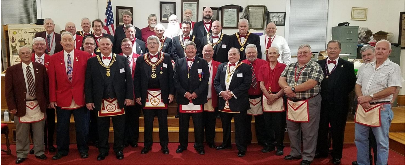
The Grand High Priest and Companions at the District 11 Visit on May 11