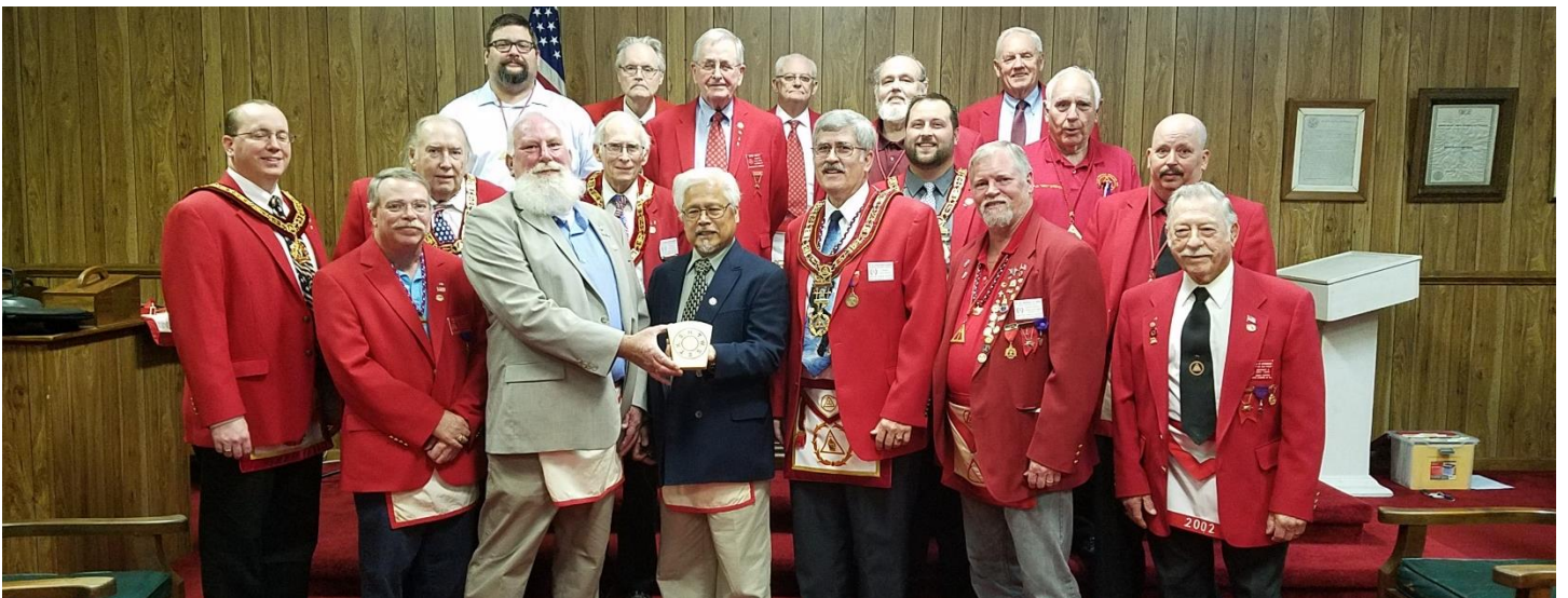
The Grand High Priest welcomes new Companions exalted recently at Mt. Nebo