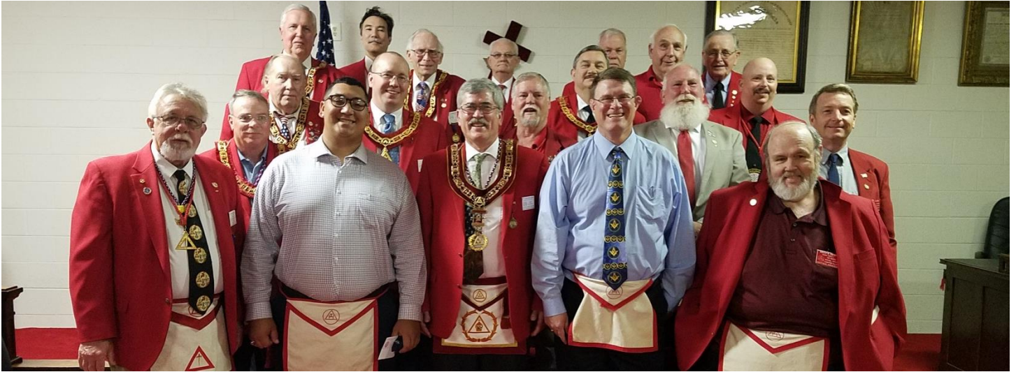
Mt. Horeb Chapter welcomes new Companions recently exalted