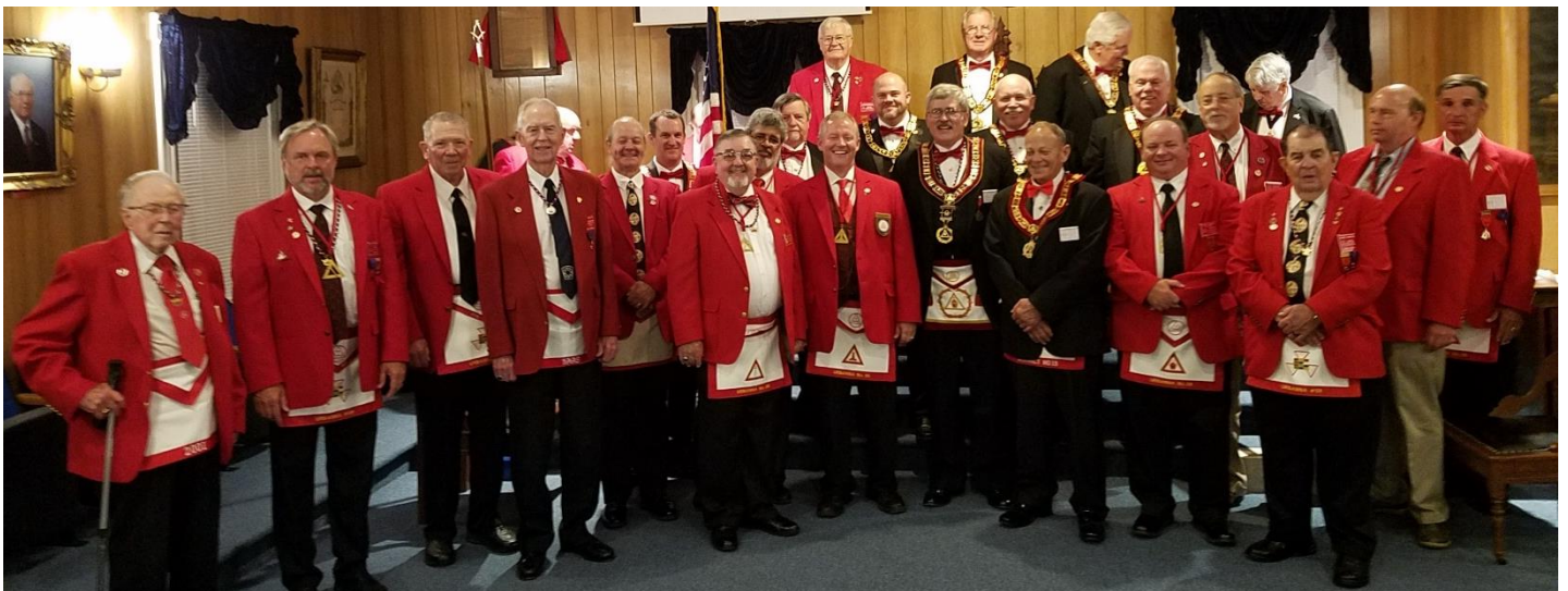
The Grand High Priest and Companions at the District 19 Visit on May 31