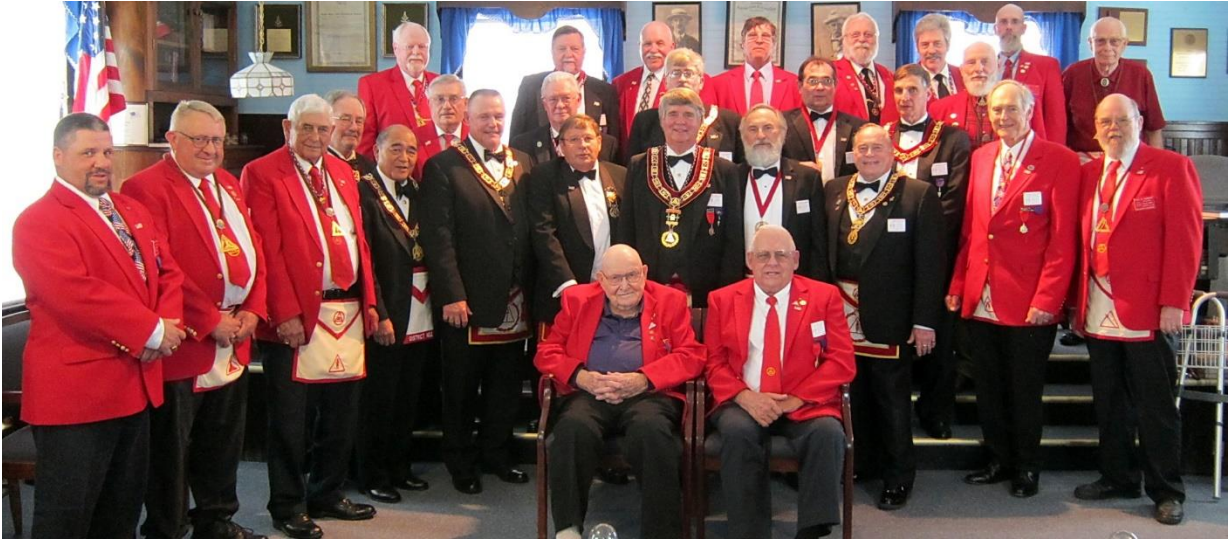
Attendees at District 18 Official Visit, Barboursville