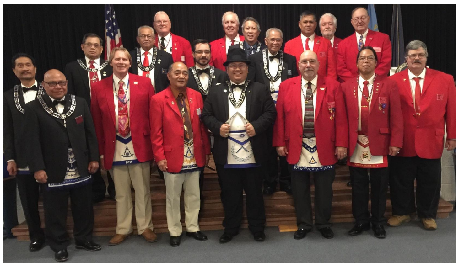
Attendees at Owens Lodge #164 "Red Coat Night"

"The Red Coats are Coming"; this year, its slogan is "Red Coats on the Move". These events have been so successful, that six more are planned for the rest of the Capitular year.