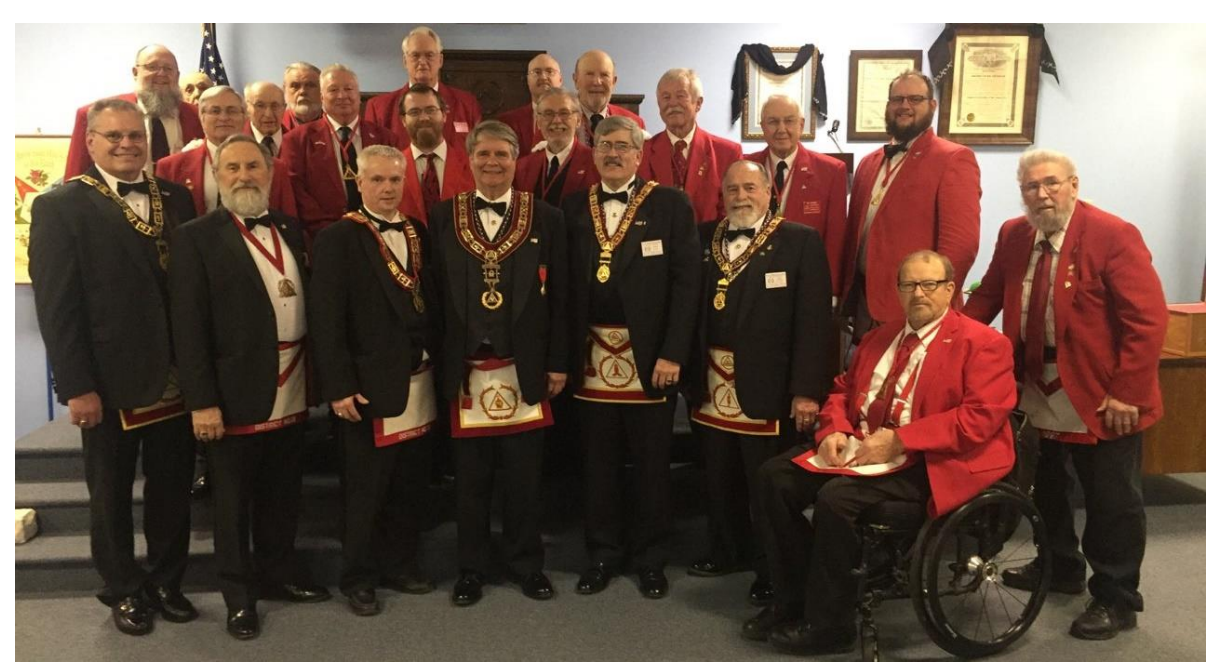
Attendees at District 15 Official Visit, Front Royal