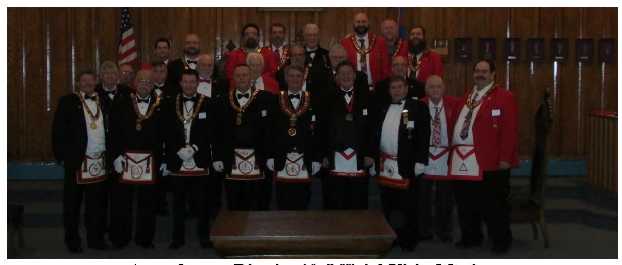
Attendees at District 10 Official Visit, Marion