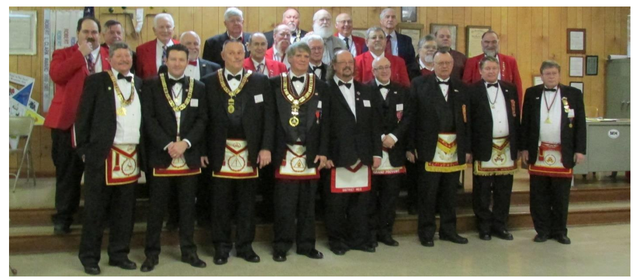
Attendees at District 11 Official Visit, Norton