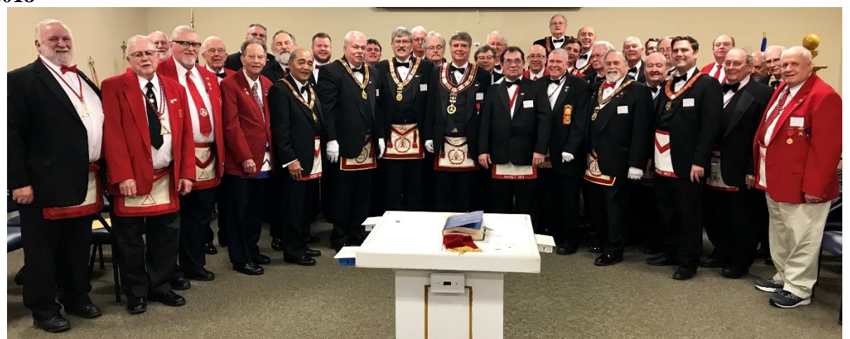
Attendees at District 4 Official Visit, Richmond