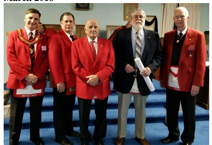
50-Year Presentation, Westmoreland #41