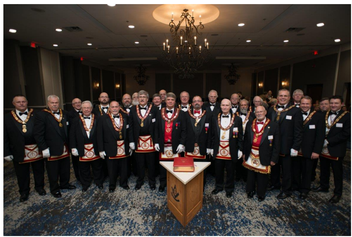
2018 Grand Chapter Officers