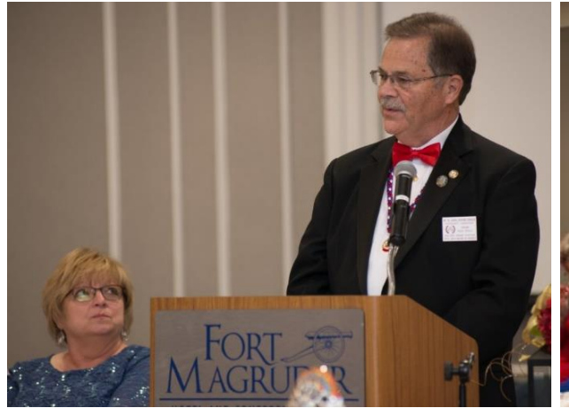
Mt. Ex. Surface at the GHP Banquet