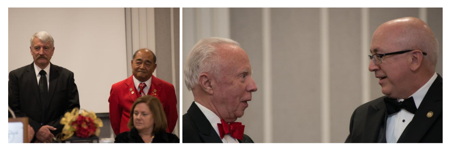
Ish Sodi Award Recipients