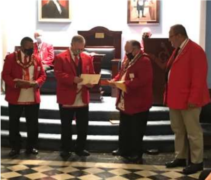
Visiting Fredericksburg No. 23