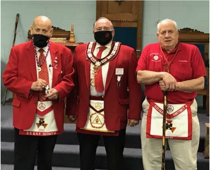
Visiting Petersburg Union No. 7