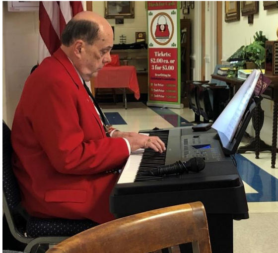
Grand Musician Hedges Entertains