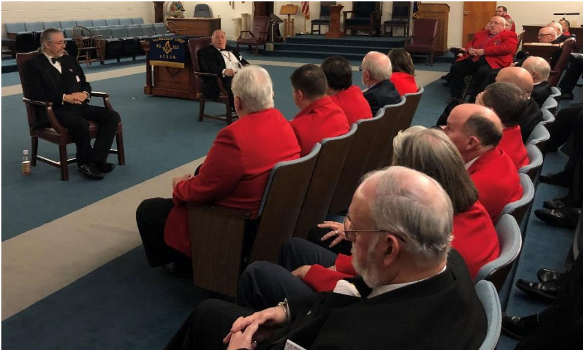
Grand High Priest Town Hall at Districts 1 and 17